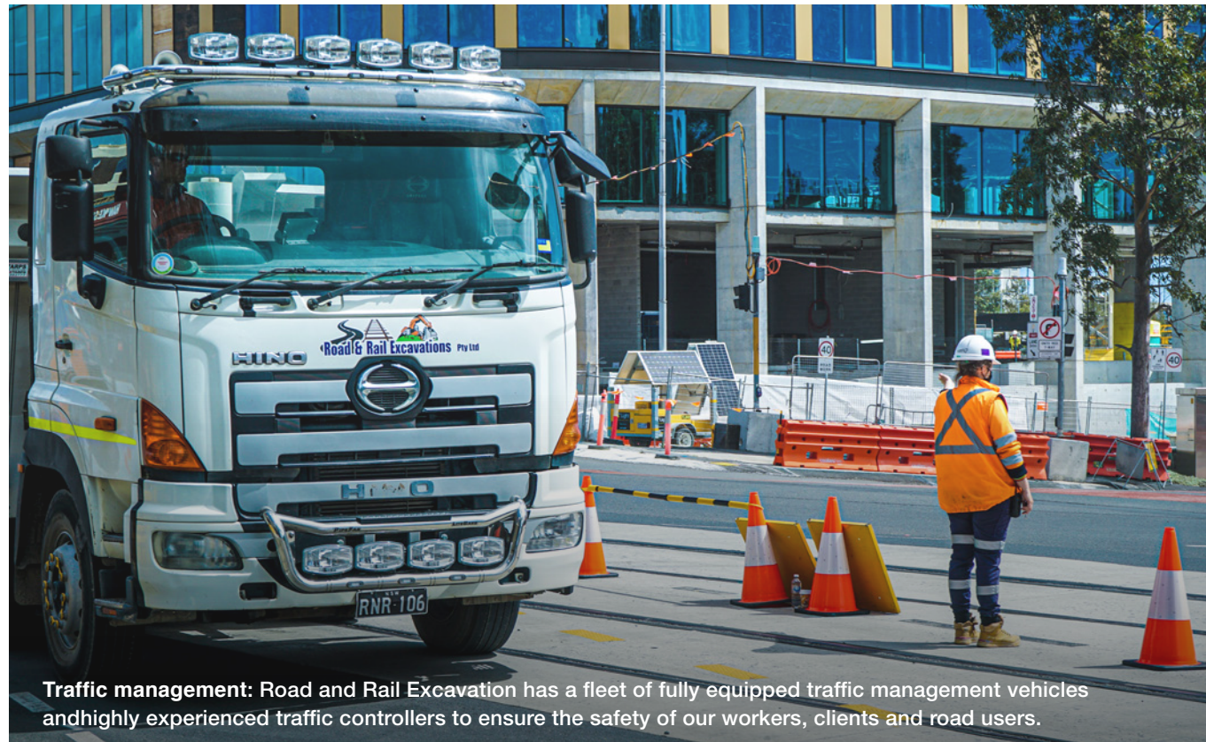
Traffic management: Road and Rail Excavation has a fleet of fully equipped traffic management vehicles and highly experienced traffic controllers to ensure the safety of our workers, clients and road users.

We seek out works optimisation wherever possible to deliver quality results in a cost-effective, time-efficient manner.