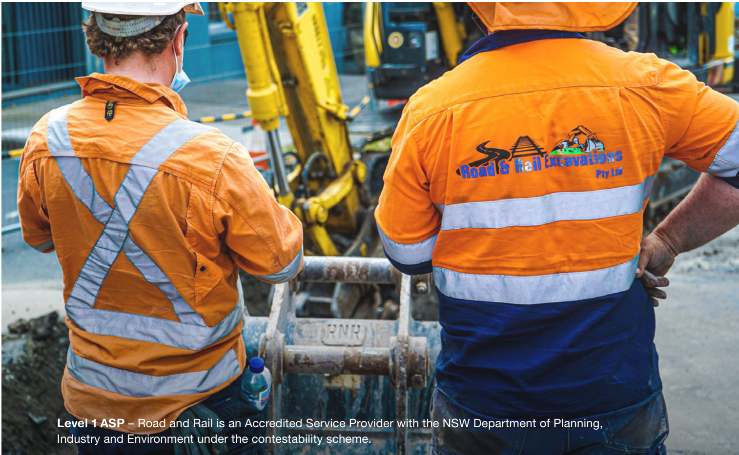
Level 1 ASP – Road and Rail is an Accredited Service Provider with the NSW Department of Planning, Industry and Environment under the contestability scheme.